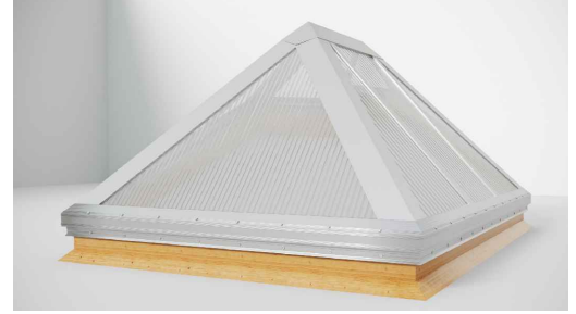
Actual product may not be exactly as shown